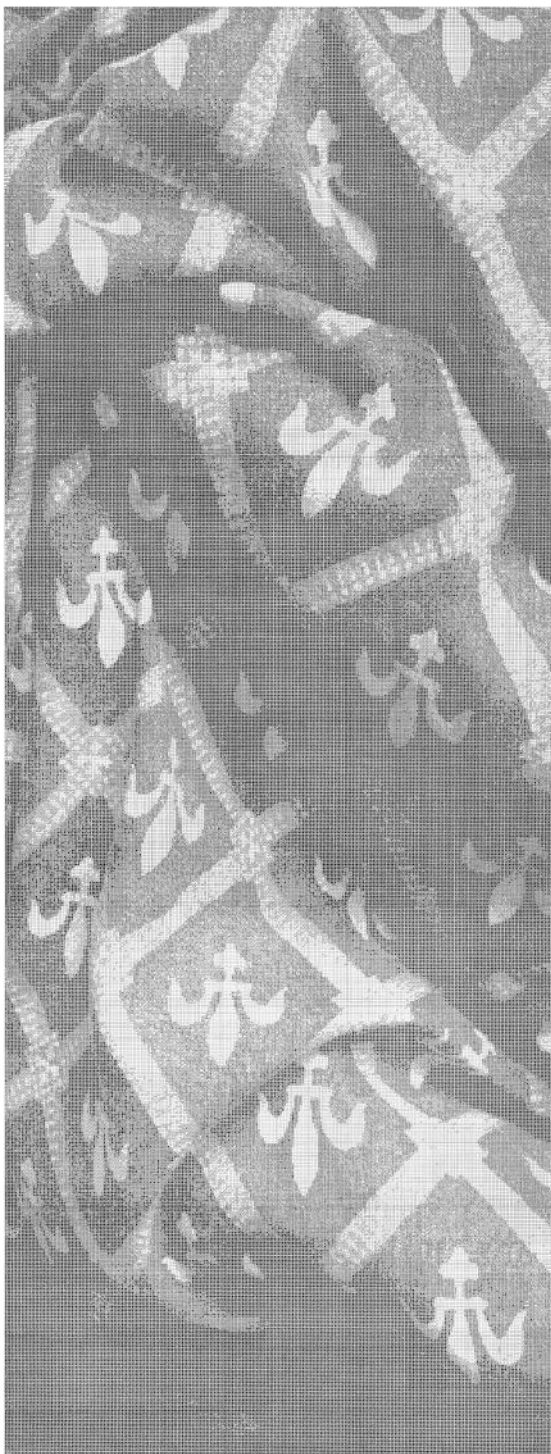
jon, my beloved (once in a lifetime) pen on cotton rag, 80.3cm (h) x 204cm (w) (framed) 2020 $6000