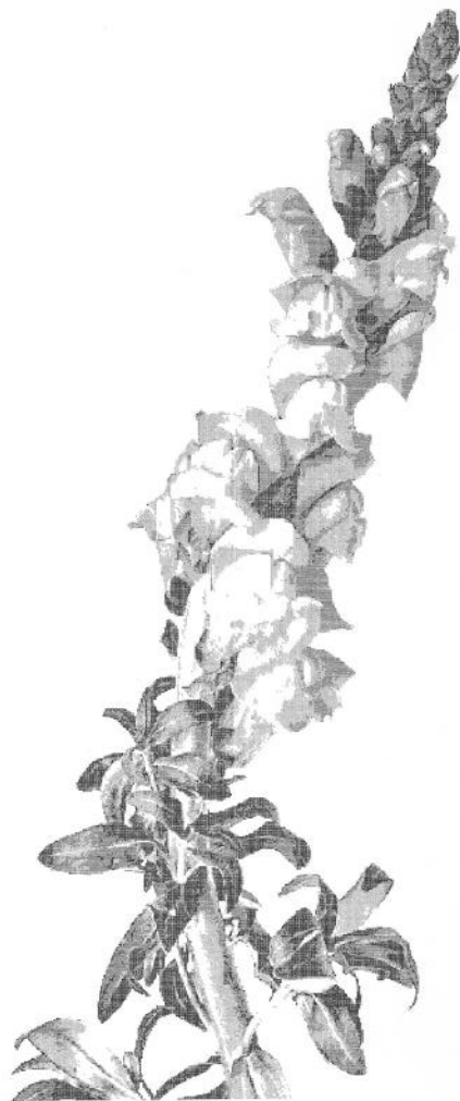
damned (if you don't know by now) pen on cotton rag, 83.5cm (w) x 119.5cm (w) (framed) 2021 $2000